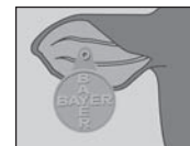
Figure 4 Apply the tag between the second and third rib cartilage.

Continual exposure of Horn Flies to a single class of insecticide (e.g. pyrethroids or organophosphates) may lead to the development of resistance to that class of insecticide. In order to reduce the possibility of Horn Flies developing resistance it is important to rotate the class of insecticide used and/or the method of Horn Fly control on a seasonal basis. Co-Ral Plus Insecticide Cattle Ear Tags contain the organophosphate insecticides coumaphos and diazinon.