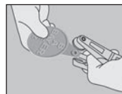
Figure 2 Slide tag under the clip of the pliers by depressing the lever.