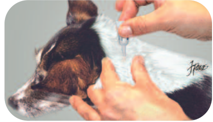
STEP 5 Part the hair on the dog's back, between the shoulder blades, until the skin is visible.

NOTES: ▶ Gentle enough for puppies 7 weeks or older. ▶ Position your dog in a standing position for ease of application. ▶ Do not get this product in your dog's eyes or mouth.