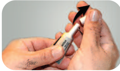
STEP 2 Hold applicator tube in an upright position. Pull cap off tube.