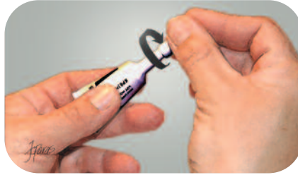
STEP 4 Twist cap to break seal, then remove cap from tube.

NOTES: ▶ Gentle enough for puppies 7 weeks or older. ▶ Position your dog in a standing position for ease of application. ▶ Do not get this product in your dog's eyes or mouth.