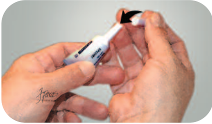
STEP 3 Turn the cap around and place other end of cap back on tube.