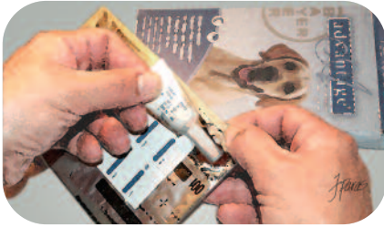
STEP 1 Remove applicator tube from package.

Advantage protects your dog from fleas year-round. Follow these simple steps every month: